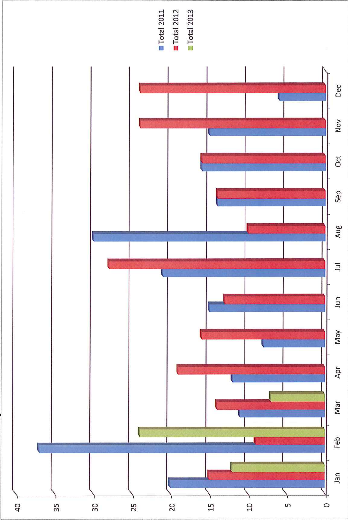
Total Number of Calls per Month in 2011/2012/2013